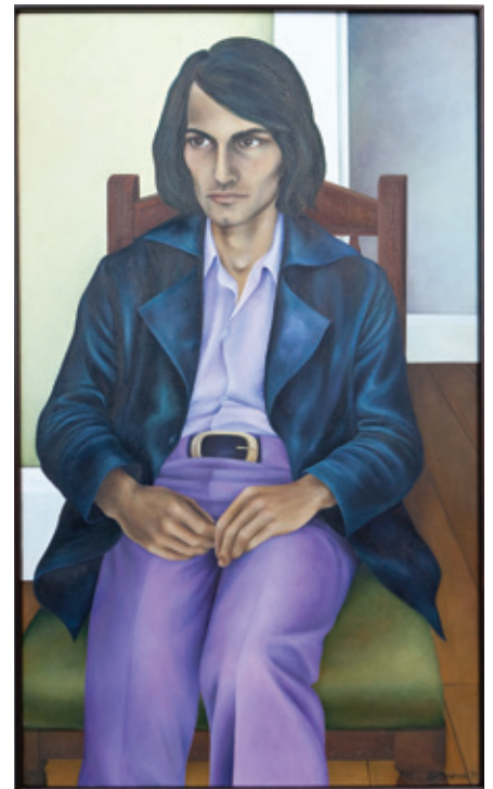
■ GLENDA RANDERSON, PORTRAIT OF BENJAMIN, 1972. COLLECTION OF THE DOWSE ART MUSEUM. GIFT

This section features photographic group portraits.